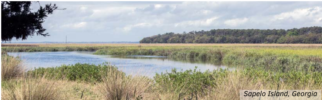
Sapelo Island, Georgia