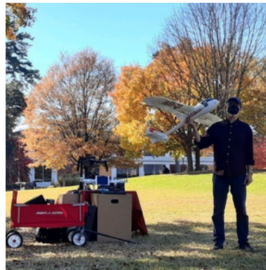
Dr. Sergio Bernardes Posing with a drone at GIS Day 2022

Learn More or Sign up to Volunteer at GIS Day 2024