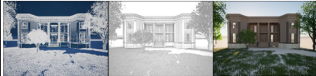
Exploring History with Digital Twins: Preserving Cultural Heritage Through Drone-Based 3D Modeling, Game Engines and Mixed Realities.